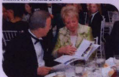
His Excellency UN Secretary Ban Ki Moon