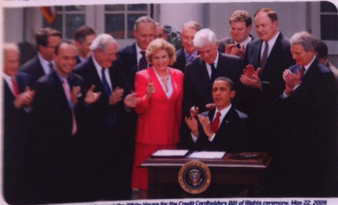
Hon. Congresswoman Carolyn B. Maloney at the White House for the Credit Cardholders Bill of Rights ceremony. May 22, 2009

In both the State Assembly and the State Senate. In 1982, Maloney ran for public office for the first time and defeated an incumbent to win a seat on the New York City Council.