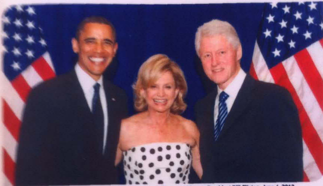
Hon. Congresswoman Carolyn B. Maloney with President Barack Obama and former President Bill Clinton. June 4, 2012