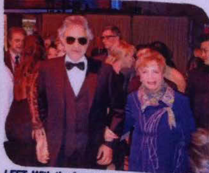
LEFT: With the famous singer Andrea Bocelli • RIGHT: With His Serene Highness Prince Albert of Monaco