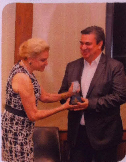
With Hon. Congresswoman Carolyn B. Malloney