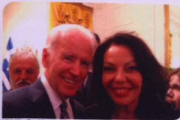
With Vice President Joe Biden